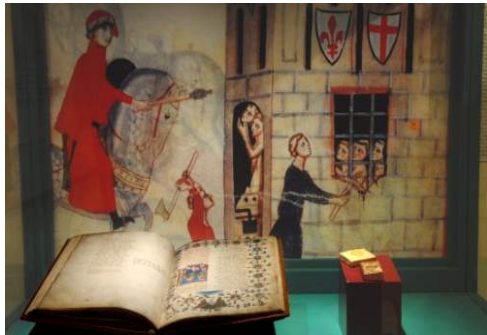
Codice Trivulziano 1080